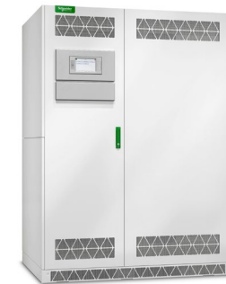
400 & 500 kVA (Aluminum) and 400 kVA (Copper)