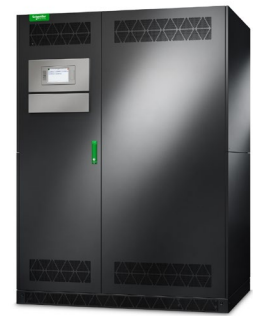
500 kVA (Copper)