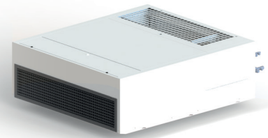
UCF0341I/0481I 6kw & 12kw Evaporators