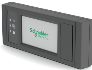
SPRD100 Color Touch Screen Display