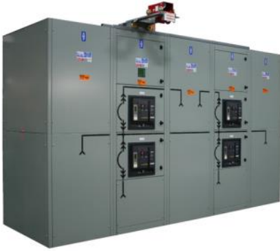
draw out circuit breakers with mimic bus and lifter

Switchboards for Industrial Applications are available with a wide variety of configurations. Can be constructed with individually mounted power circuit breakers or fused bolted pressure switches. Compartmentalization of bus available for increased safety.