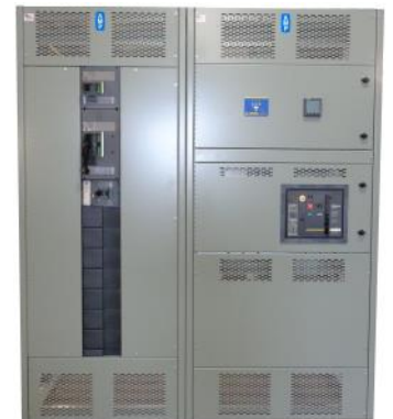
circuit breaker switchboard

All brands of fuses and circuit breakers are available to be installed in AMP's distribution switchboards.