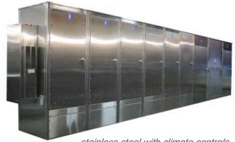
stainless steel with climate controls