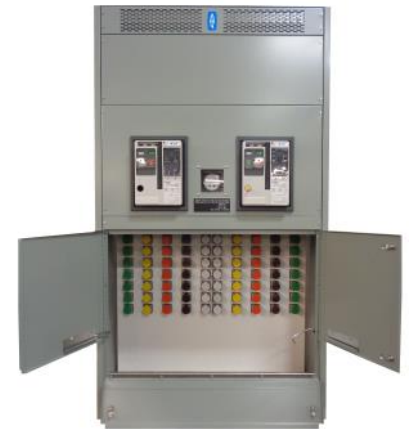
switchboard with cam-lock connectors