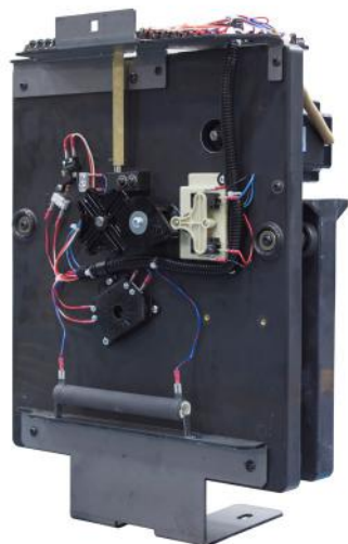
Figure 3. QD3 Quik-Drive tap-changer

The load tap-changer product offering from Eaton's Cooper Power series consists of three Quik-Drive™ tap-changers, the most advanced tap-changers in the industry. Each device is sized for a specific range of current and voltage applications and the devices share many similarities in their construction. The primary benefits of Quik-Drive tap-changers are: direct motor drive for simplicity and reliability; high-speed tap selection for quicker serviceability; and proven mechanical life (one million operations). Common Quik-Drive tap-changer features include: neutral light switch; position indicator drive; safety switches; and logic switches (back-off switches). Quik-Drive load tap-changers meet IEEE® and IEC standards for mechanical, electrical, and thermal performance.