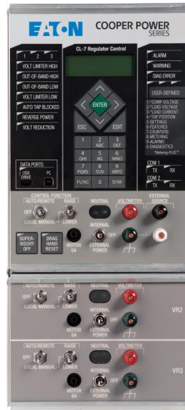
Figure 2. CL-7 control