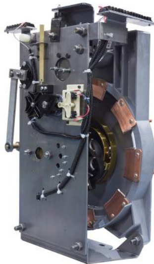
Figure 4. QD5 Quik-Drive tap-changer