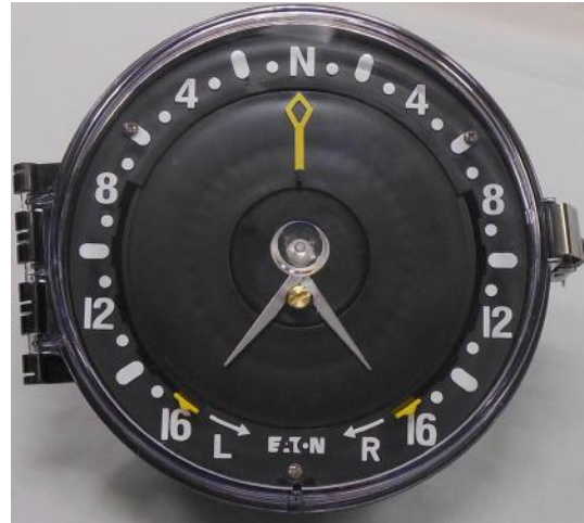
Figure 6. Position indicator

The five possible load current ratings associated with the reduced regulation ranges are summarized in Table 4 and Table 5. At each setting, a detent stop provides positive adjustment. Settings other than those with stops are not recommended. The raise and lower limits need not be the same value except for locations where reverse power flow is possible.