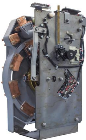
Figure 5. QD8 Quik-Drive tap-changer